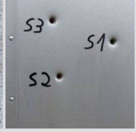
Impact marks of several .44 Rem. Magnum projectiles on the door leaf of a NovoPorta Premio.