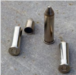
Calibre .357 Magnum Bullet weight 10.2 g Impact at 430 m/s Impact force of coned bullet 943 J