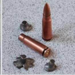
Calibre 7.62 x 39 Bullet weight 8.0 g Impact at 720 m/s Impact force of pointed bullet with iron core 2074 J