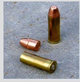
Calibre .44 Rem. Magnum Bullet weight 15.6 g Impact at 440 m/s Impact force of flat nose bullet 1510 J

The uniform appearance of NovoPorta Premio doors is another attractive feature. It is not immediately visible whether the door is bullet-proof, fire-resistant or burglar-proof – a quality that represents a clear advantage in building construction.